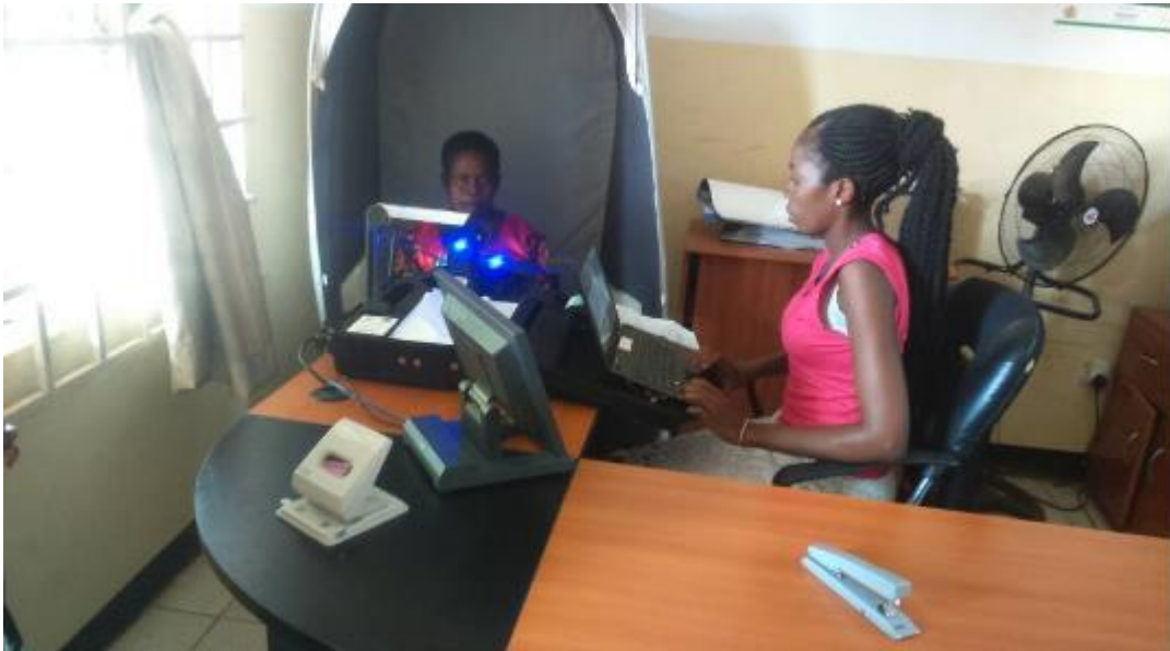
Continuous registration in progress in Balaka: An NRB Officer assisting a citizen to register for National ID card.