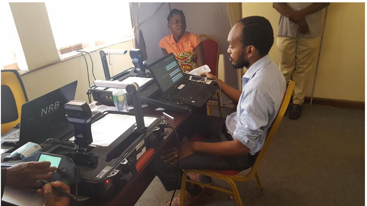
Continuous registration in progress in Blantyre: An NRB Officer assisting a citizen to register for National ID card.